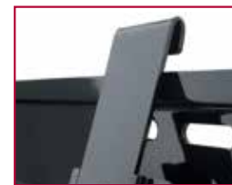
Easy hook-on design