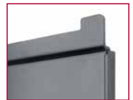
Specially designed safety tabs for secure support

Patented. Design Patent No. D679,571. Utility Patent No. 8,154,885.