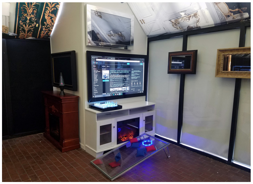
Smart Mirror Displaying Google News Reports

The VanityVision Smart Mirror is the cutting edge of hidden display technology . It is the perfect balance of reflection and transparency, and offers superior quality compared with a two way mirror, providing a tint-free view of text and pictures.