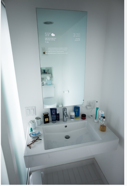
Frameless smart mirror by Max Braun

We can cut and ship sizes up to 96"x130" anywhere in the world. In addition, we are able to drill sconce holes and temper, bevel, and polish the edges.