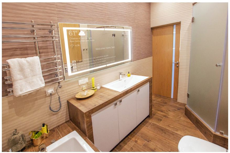
Smart Mirror With LED Backlighting