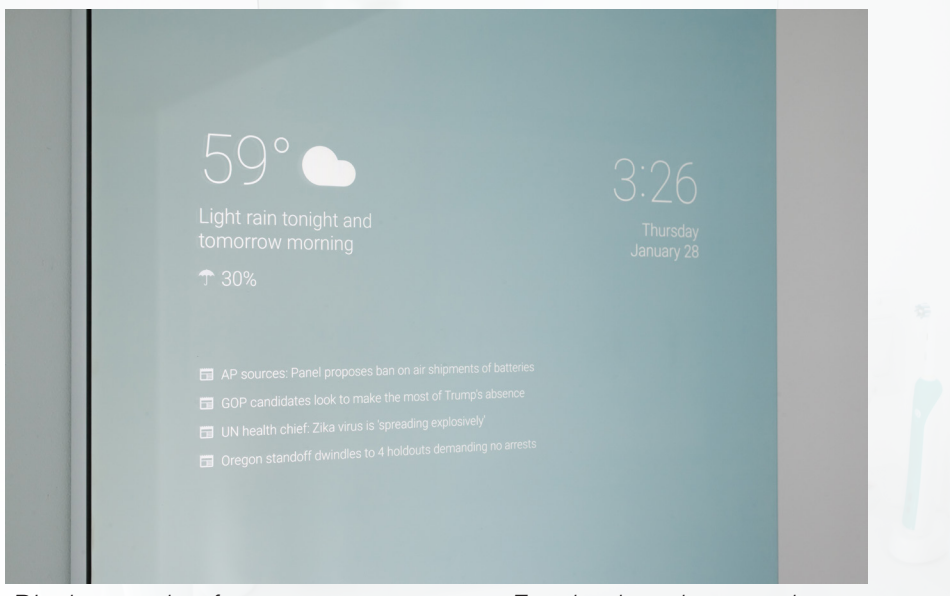
Display weather forecasts, sports scores, Facebook updates, and more

We sell complete units which utilize a 4k Samsung LED TV. Check out www.hiddentelevision.com/smart-mirror/ for more details.